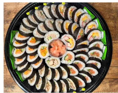
ASSORTED SUSHI $90