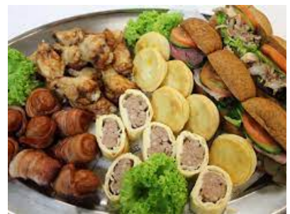
VEGAN / VEG / GLUTEN FREE PLATTER $50