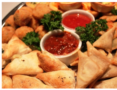
HOT FOOD PLATTER $100