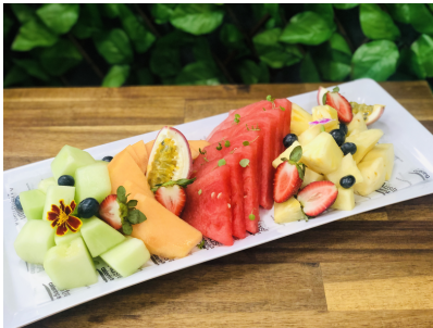
FRUIT PLATTER $60