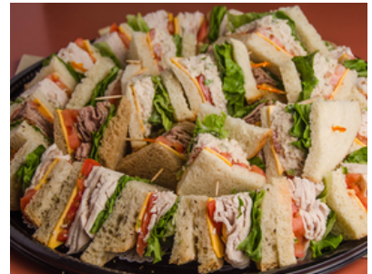
SANDWICH / WRAP PLATTER $70