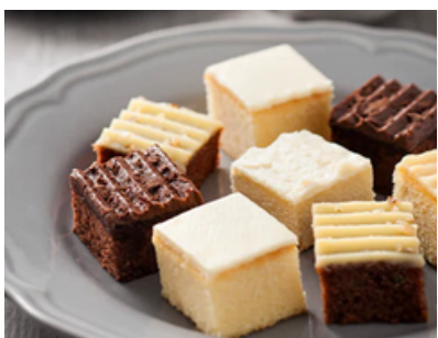
CAKES & SLICE PLATTER $60