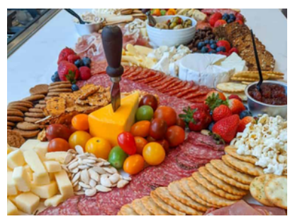
GRAZING TABLE $650