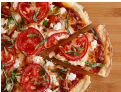
PIZZA SLAB $45