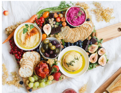
MEZZE BOARD $90